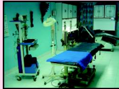
State of the art Operation theatre for your comfort & total safety

Mesotherapy - Beauty / Fat reduction by medicines.